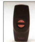
On/Off Hand Held Remote Control with Receiver