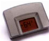
Touch Light™ Table Top/Wall Mount TLM On/Off Remote Control with Receiver.