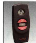
On/Off Hand Held Remote Control with 90 min. countdown timer with Receiver and LCD Display