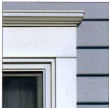
5" Lineal with Crown Molding