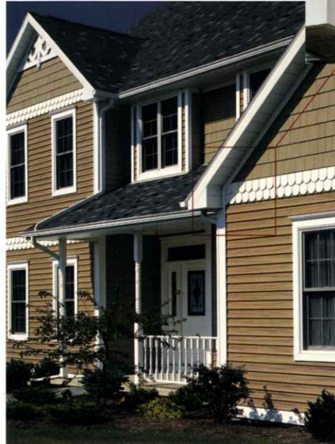
Double 7" Perfection Shingles in natural clay and Monogram double 4" in frontier blend. Half-Round Shingles, 3-1/2" Lineals, Crown Molding and Traditional SuperCorner in colonial white.