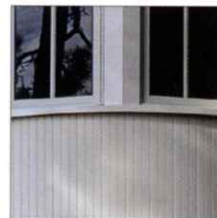
Trimboards, Sheets, Corners, Beadboard, Brickmould, Drip Cap and more...

Restoration Millwork™ solid-core trim makes an authentic statement on your home. Available in smooth and realistic woodgrain TrueTexture™ finish in a wide variety of traditional and specialty profiles – you can also mill it or paint it to create custom designs.