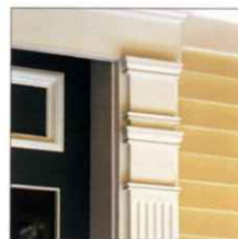
Window & Door Casings, Panels, Detailed Millwork and Special J-Pocket Accessories for Vinyl Siding