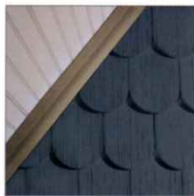
Cornice Molding with Cedar Impressions Half-Round accents and Vinyl Carpentry Triple 2" Beaded Soffit