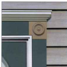
3-1/2" Lineal with Crown Molding, Corner Block and Rosette