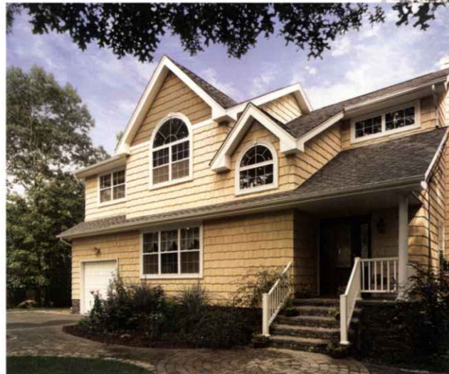
Double 9" Rough-Split Shakes in light maple and buckskin with 5" Lineal bandboard in colonial white.