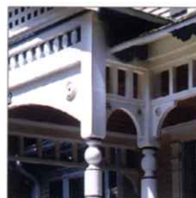
Column enclosures, Soffit, Fascia or Custom Milled Designs