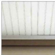
Beaded Triple 2" Panel with Soffit Cove Molding